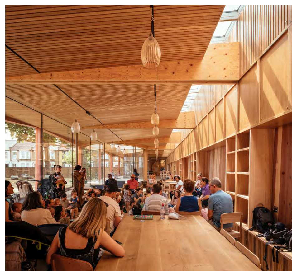
Lea Bridge Library refurbished entrance and café, London, UK (Studio Weave)

The current informal reading room and self-serve coffee station at the ground floor can be reconfigured into a single space with a variety of seating types. This new space will function as the community living room, with information on library programming and an informal space for community gatherings and library events, such as book readings, language meetups, or writing workshops.