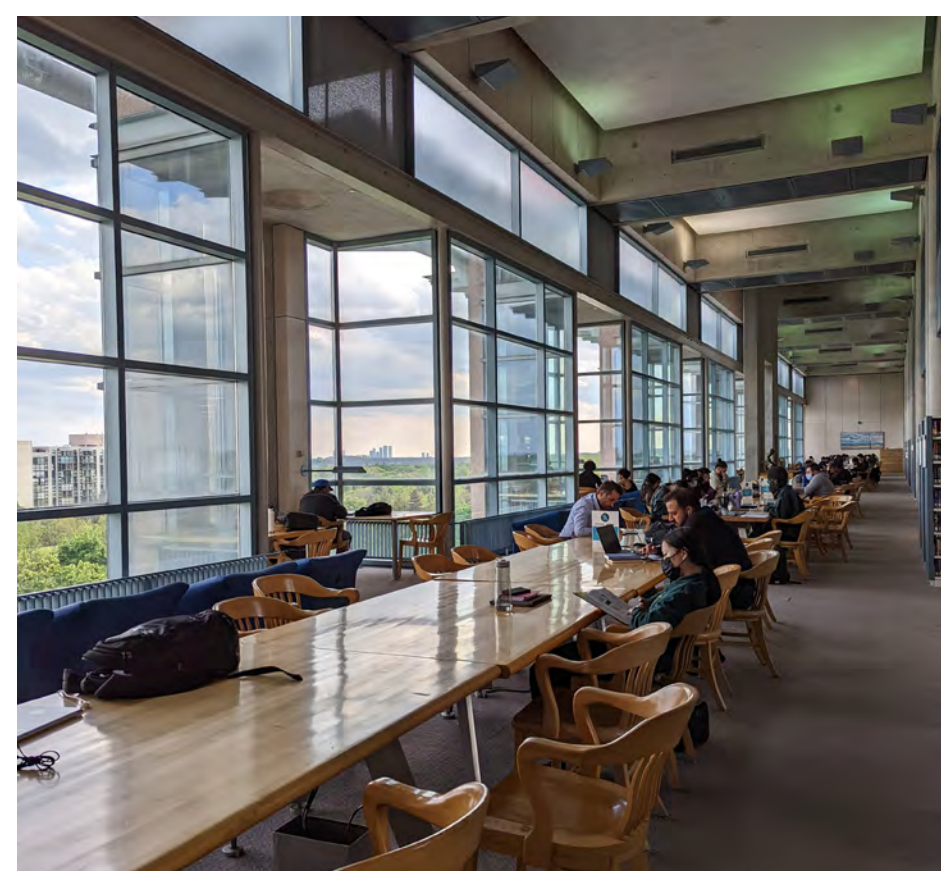
Long shared study tables at the Central Library, Richmond Hill

Large, communal study tables will provide new types of study space. New tables could be located on the second floor or in conjunction with the new self-serve café space on the ground floor. Tables should have integrated lighting and plug-ins for laptops and other devices.