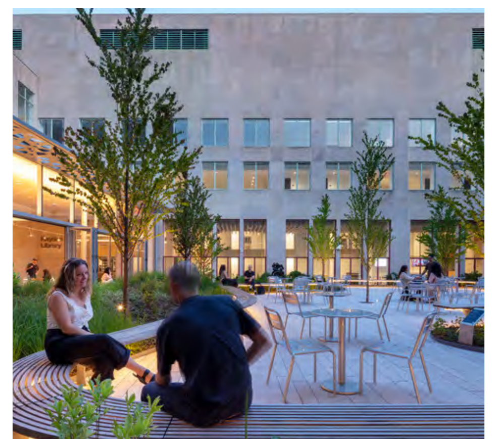
Hayden Library, Cambridge, USA (Kennedy & Violic Architecture; John Horner)

In the warmer months, the community living room and café space can extend outdoors through the large sliding glass doors. Flexible seating spaces will allow visitors to read, meet, and study, and can be reconfigured to hold special events. An outdoor area will also allow for greater variety of kids programs, with a new place to play, make noise, and get messy.