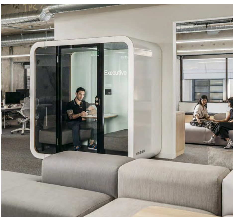
Framery Q Office Pods

Users have reported the need for more study space at this branch, and the small bookable rooms on the second floor are in high demand. Central Branch is currently undergoing a pilot project to test out small privacy pods for individuals or groups. If successful, they could be a welcome addition to Oak Ridges Branch.