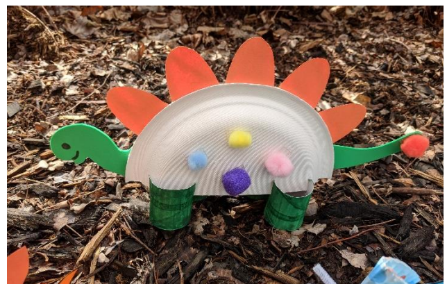
Cut a paper plate in half. Cut out a head and tail, and 5 spikes. Glue or tape them in between the paper plates. Then decorate and add toilet roll legs!