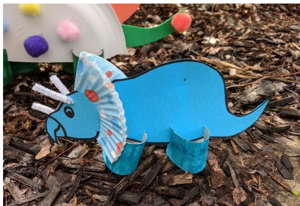
Make a Triceratops frill using a folded cupcake liner. His horns can be made from a pipe cleaner.