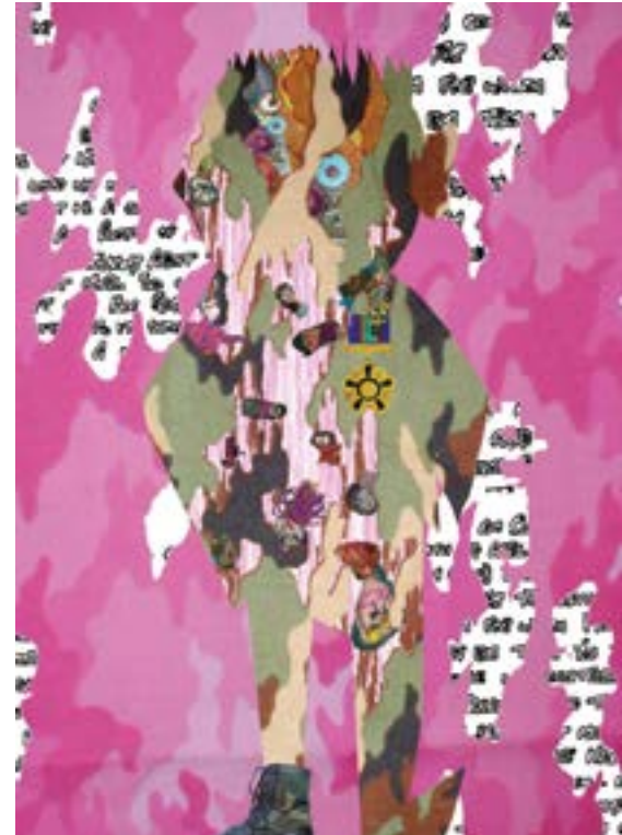
Exhibit: Stitched Identities